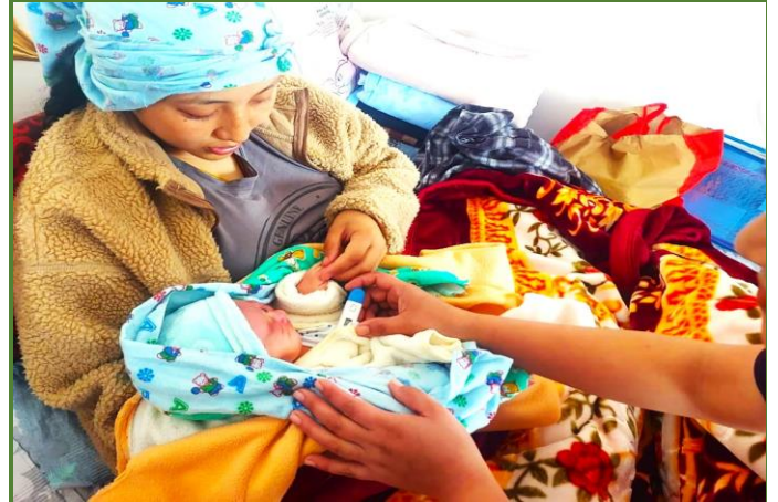
(ASHA Worker measuring the temperature of an infant)

This calendar year (2023) SASAC-Woodcot successfully organized 115 training courses and trained 3147 ASHAs for Darjeeling and Kalimpong districts. ASHAs work at the grass root level with women and children. Their main aim is to prevent child mortality. Their work includes motivating rural women to give birth in hospitals, bringing infants and children to immunization centers, treating basic illness and injuries, keeping demographic records, improving village sanitation, promoting health and hygiene, surveys and so on.