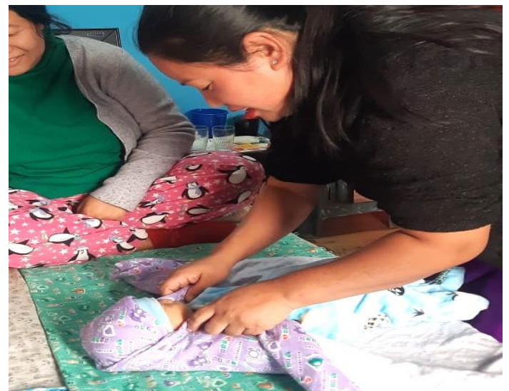
(ASHA Worker teaching a woman who to wrap an infant)